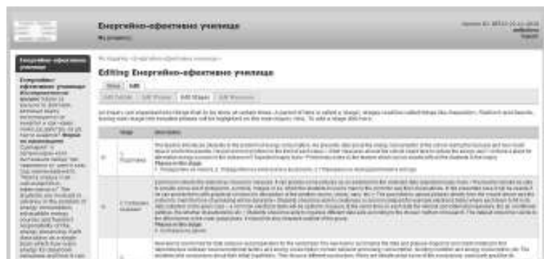
Figure 9: Description of a research scenario for education in nQuiry

The experiment showed that although nQuiry provides a lot of utilities, it still needs additional options to be able to ensure an effective and efficient implementation of the research approach. For example, it is focused primarily on individual studies that can be monitored and controlled by the teacher. Although it has the tools to organize group work, it does not offers enough opportunities for visualizing and integration of the performance of the particular groups.