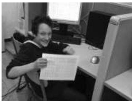
Figure 6: Entering the data in a digital form

Right after measuring the observed factors students entered the collected data in the sheet. Once a week they entered the data from the wall sheets to the electronic spreadsheet during the classes of Information Technologies (Fig. 6).