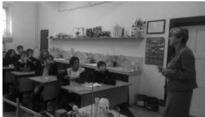
Figure 2: Introducing the topic