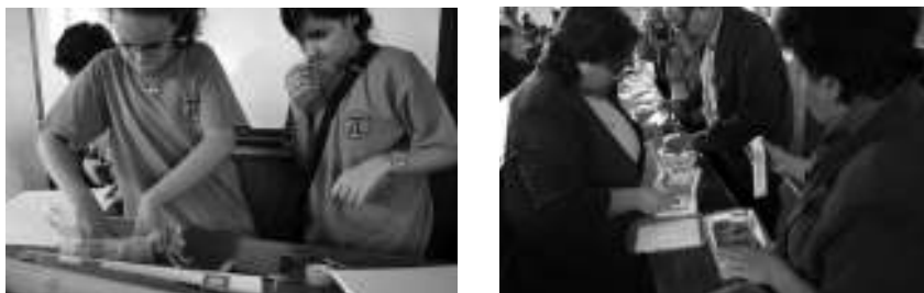
Figure 8: Experiments during the workshop

The second stage included a 12-minute practical workshop. Every team had a plastic box, which symbolized its classroom, a ruler, a pen, markers, a glue, a cardboard, an styrofoam, an aluminum foil and old newspapers. They had to isolate the box. The isolation was tested by putting ice and a thermometer in every box (Fig. 8).