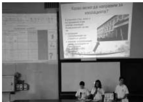
Figure 7: A team shares the whole class findings

in order to prove it (Fig. 7). They also made concrete proposals for better energy consumption.