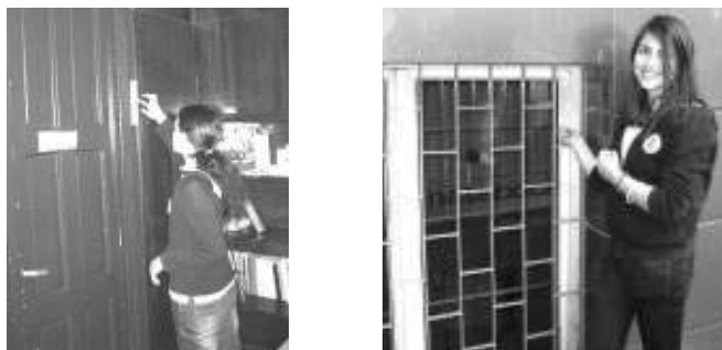
Figure 5: Measuring the temperature in the classroom (left) and outside the school (right)

Before starting the collecting period, the students put thermometers in each classroom and outside the school. Fortunately the classrooms of the three classes are on different floors of the building - on the ground one, on the first and on the second. In each classroom they put a printed table on the wall for writing the measured data 3 times a day (Fig. 5).