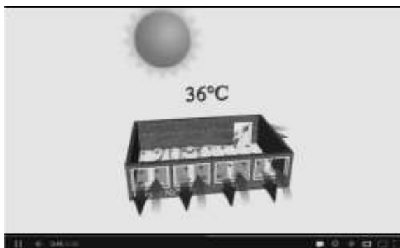
Figure 10: Classroom Energy Simulation (Summer) [14]

These observations and recommendations were passed to the weSPOT developers in order to take them into account during the development of tools in the frame of the project. Some of them inspired the developers to create simulations, like the one shown in Fig. 10, which was developed by using the Elica software.