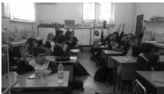
Figure 3: Discussing the energy consumers and climate conditions

The students chose which are the most important questions and stated their hypothesis based on the expected answers. After formulating the hypothesis, they formed 5 teams in each class to explore each question/hypothesis in parallel.